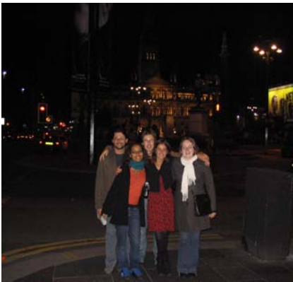
ESA Summer school Students