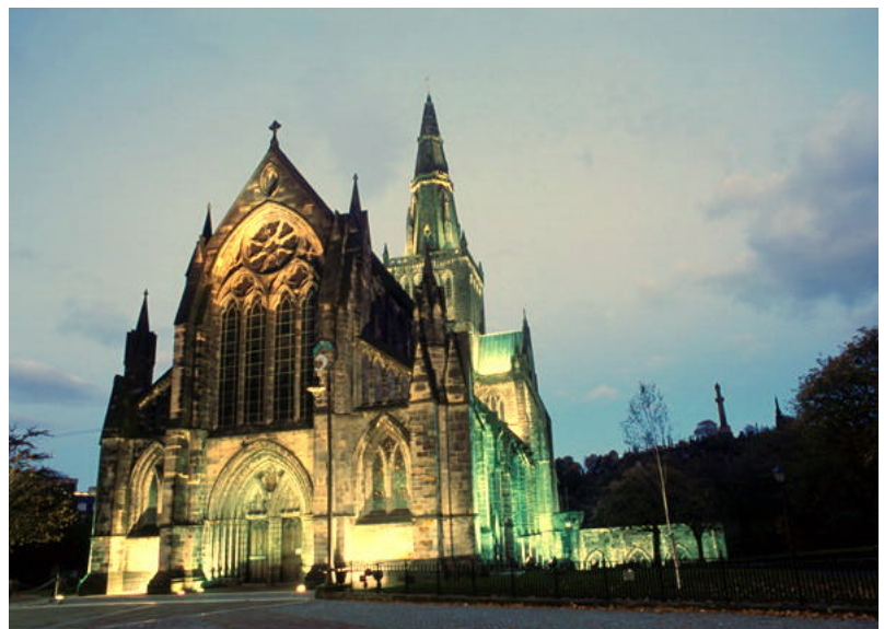
The Cathedral of Glasgow at Night